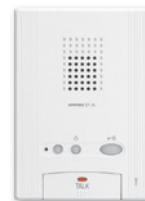
GT-1A Tenant Station